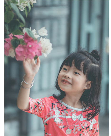
APPRECIATION OF BEAUTY & EXCELLENCE