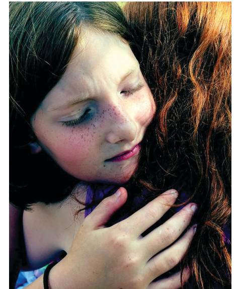
FORGIVENESS & MERCY