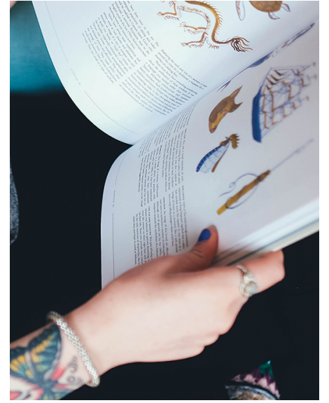
LOVE OF LEARNING