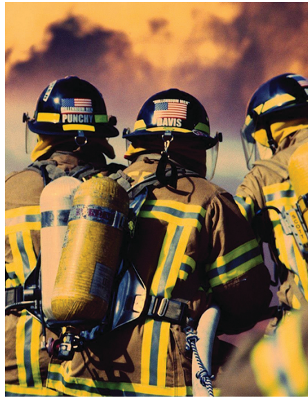
BRAVERY & VALOUR