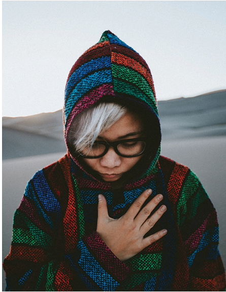
MODESTY & HUMILITY